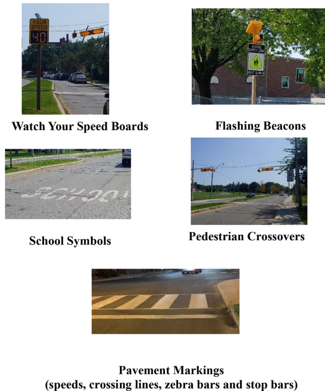
Figure 1 School interventions, City of Toronto (photos by LR, 7 August 2021).

to AST (walking, cycling and other non-motorised transportation) were also measured as AST has health benefits related to physical activity, enhances community and social engagement and benefits the environment. Last, dangerous driving behaviours were measured as they have been associated with higher area-level collision rates surrounding schools and could potentially be associated with less AST. 13 The overall goal of the Vision Zero interventions was to enable safe active transportation by reducing speeds.