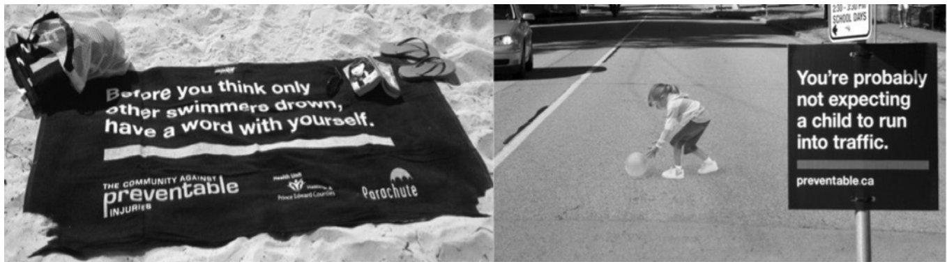
Figure 3 Preventable messaging at the time and place that injuries are likely to occur.

evaluation tended to be more fatalistic about injuries, indicating that it is not feasible, or even desirable, to prevent all injuries. These parents felt that children needed freedom to test their limits and that some risk was the cost of the learning experience vital to normal healthy growth and development. At the same time, they expressed a strong need to set a good example and take more precautions when in the presence of their children. These findings are reflected in the current study, with parental status predictive of higher scores on preventability and conscious thought.