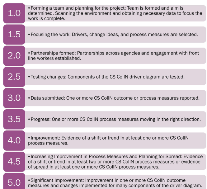
Figure 2 The CS CoIIN Progress Scale note 1. The CS CoIIN Progress Scale was adapted from the IHI BTS model. 29

along process measures within 1 year. This was achieved through application of the CS CoIIN framework that utilized the collective impact approach, 11 BTS, 9 and MFI 8 with three key adaptations. The first adaptation was to broaden the group of stakeholders who develop the driver diagrams and measurement strategies to include both subject matter and application experts from the National Coordinated Child Safety Initiative Steering Committee, CSN, HRSA and state/jurisdiction practitioners in order to address the challenge of translating research into practice across multiple injury and violence prevention topics. The second adaptation was to use a blended delivery model that replaced two face-to-face learning sessions with 4-hour virtual meetings, to facilitate increased participation. A third adaptation that emerged midway through the CS CoIIN was creation of a CS CoIIN progress scale to reflect working in a complex, multisectoral environment at the population health level. The scale recognizes early work should focus on states/jurisdictions aligning CS CoIIN activities with strategic plans, scanning and assessing their environments and building partnerships. 8