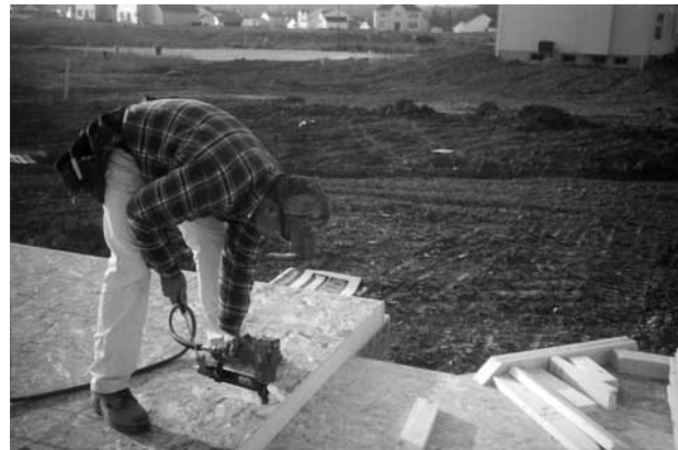
Figure 1 Contact trip stapler gun.

We report on nail gun injuries among a large cohort of union residential carpenters identified through active injury surveillance that included documentation and description of circumstances surrounding injuries from these tools, calculation of injury rates, and identification of high risk groups and preventive measures.