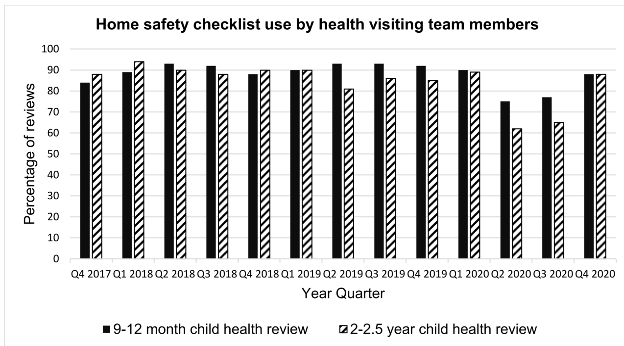
Figure 2 Electronic medical record data of self-reported SOSA home safety checklist use at child health reviews by health visiting team members. SOSA, Stay One Step Ahead.

were used with variable frequency: 72% consistently used a one-page height chart developed by Royal Society for the Prevention of Accidents (RoSPA), whereas 25% reported regularly using RoSPA's 'Keep Me Safe at Home booklet'.