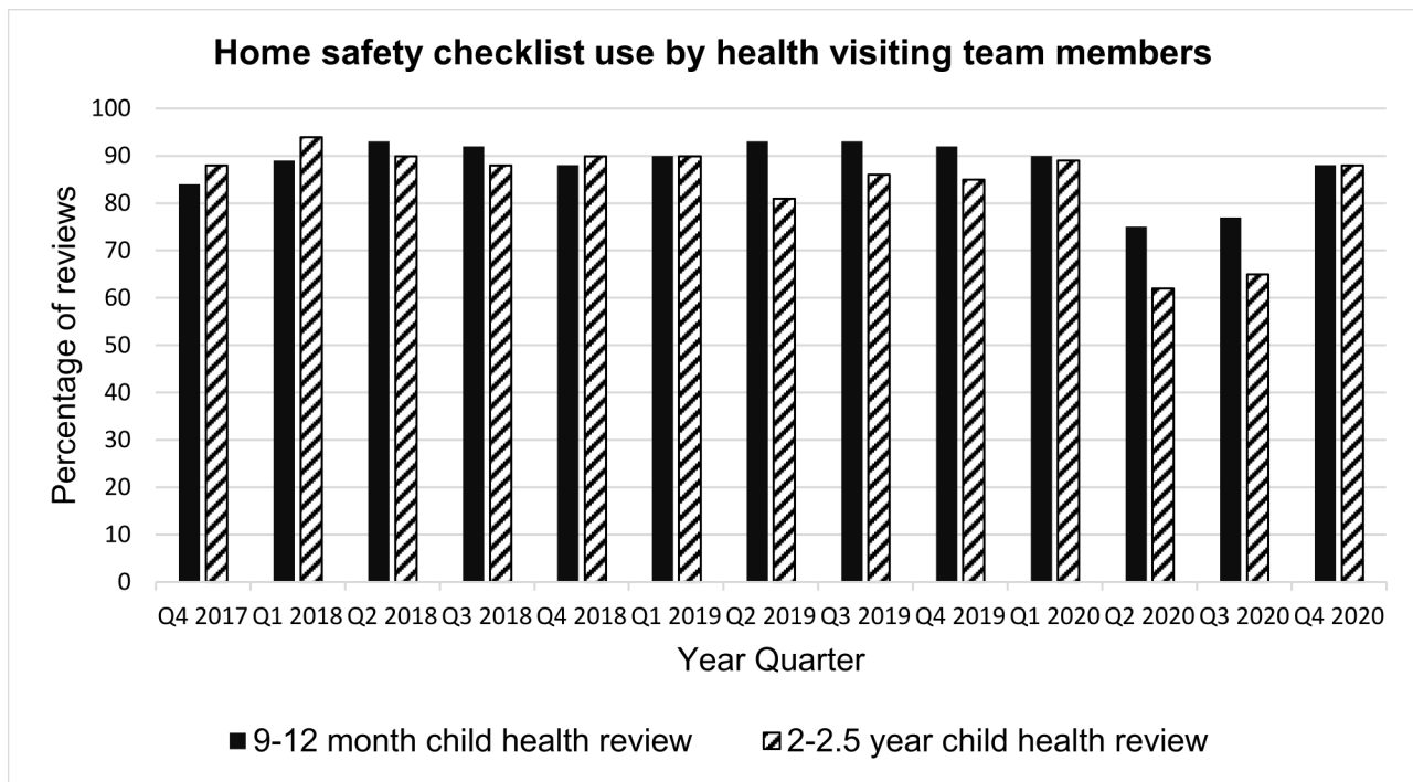
Figure 2 Electronic medical record data of self-reported SOSA home safety checklist use at child health reviews by health visiting team members. SOSA, Stay One Step Ahead.

were used with variable frequency: 72% consistently used a one-page height chart developed by Royal Society for the Prevention of Accidents (RoSPA), whereas 25% reported regularly using RoSPA's 'Keep Me Safe at Home booklet'.