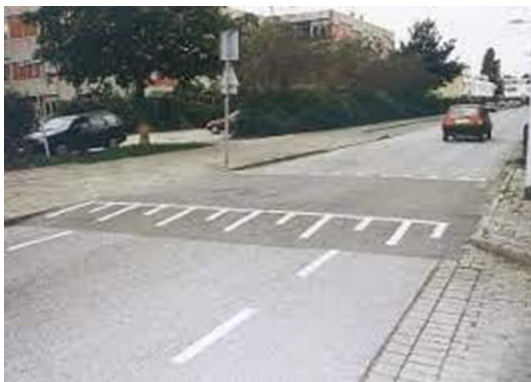
Figure 2 Circular speed hump as reported in Ghana Highway Authority (GHA) traffic calming design guidelines.

Second, the GHA was contacted for their inventory on SHs on the sampled trunk roads to guide selection of settlements that would serve as intervention sites. Traffic injury data were available to year 2020; hence, roads traversing settlements that had SHs installed between 2014 and 2017 were selected as intervention sites. This was done to obtain 3 years of before-and-after data. Each intervention settlement had an average of two consecutive SHs.