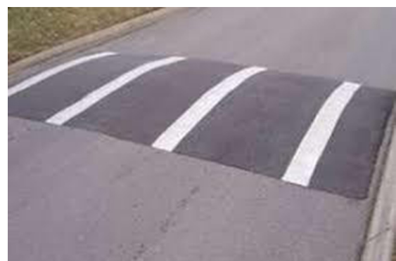
Figure 3 Trapezoidal speed hump as reported in Ghana Highway Authority (GHA) traffic calming design guidelines.