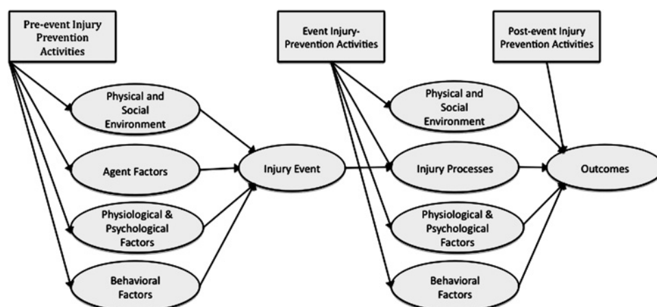
Figure 1 A basic template for an influence diagram of injury risk processes. Adapted from Morgan et al 13 and reprinted with permission from Cambridge University Press.

Experts should represent the range of views on relevant topics. For injury prevention they would include epidemiologists who understand risk factors, experts in the technologies and environments creating or mitigating risks, policy analysts