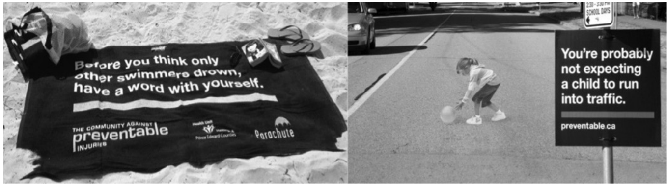
Figure 3 Preventable messaging at the time and place that injuries are likely to occur.

evaluation tended to be more fatalistic about injuries, indicating that it is not feasible, or even desirable, to prevent all injuries. These parents felt that children needed freedom to test their limits and that some risk was the cost of the learning experience vital to normal healthy growth and development. At the same time, they expressed a strong need to set a good example and take more precautions when in the presence of their children. These findings are reflected in the current study, with parental status predictive of higher scores on preventability and conscious thought.