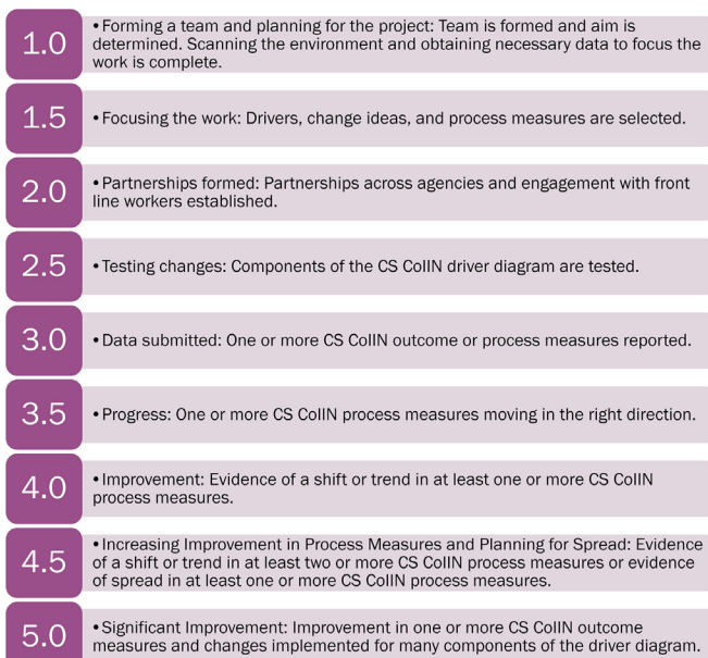
Figure 2 The CS CoIIN Progress Scale note 1. The CS CoIIN Progress Scale was adapted from the IHI BTS model. 29

along process measures within 1 year. This was achieved through application of the CS CoIIN framework that utilized the collective impact approach, 11 BTS, 9 and MFI 8 with three key adaptations. The first adaptation was to broaden the group of stakeholders who develop the driver diagrams and measurement strategies to include both subject matter and application experts from the National Coordinated Child Safety Initiative Steering Committee, CSN, HRSA and state/jurisdiction practitioners in order to address the challenge of translating research into practice across multiple injury and violence prevention topics. The second adaptation was to use a blended delivery model that replaced two face-to-face learning sessions with 4-hour virtual meetings, to facilitate increased participation. A third adaptation that emerged midway through the CS CoIIN was creation of a CS CoIIN progress scale to reflect working in a complex, multisectoral environment at the population health level. The scale recognizes early work should focus on states/jurisdictions aligning CS CoIIN activities with strategic plans, scanning and assessing their environments and building partnerships. 8