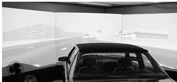
Figure 2 University of Massachusetts driving simulator.

lag behind it a reasonable distance (the lead vehicle indicated to the participant driver when to turn and in which direction).