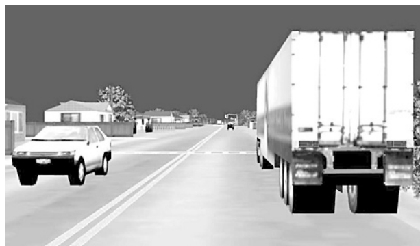
Figure 3 Simulator view: truck crosswalk scenario.

One of the potential weaknesses of the above study is that the trained novice drivers were evaluated on the driving simulator immediately after they had completed the PC based training. In order to remedy this shortcoming, the above study was replicated, only this time 12 novice drivers were evaluated on the simulator 3–5 days after training. 29 This represents a period of time which might elapse between PC based training in driver education classes and the novice driver's applying that training on the road as part of the learner's permit phase. Another set of 12 participants was