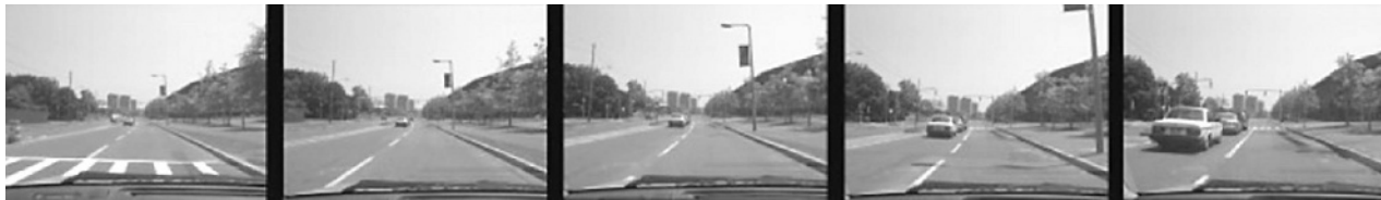
Figure 4 Sequence of (five) perspective snapshots for the abrupt lane change.

from these 10 locations in the field were scored blindly, and used to analyze the eye glance behavior of the drivers. We find that significantly more trained drivers (70%) in the near transfer scenarios fixated areas of the roadway scenarios which contained information which could reduce their likelihood of a crash than do untrained drivers (33%, p < 0.001 ), a difference almost identical to what was observed on the driving simulator. Furthermore, the differences in the trained (59%) and untrained (39%) drivers on the far transfer scenarios were smaller, though still significant ( p < 0.01 ).